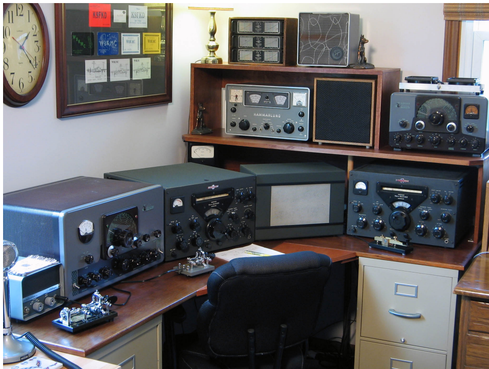
Valiant / 75A-4 & Ranger / 75A-4 Stations