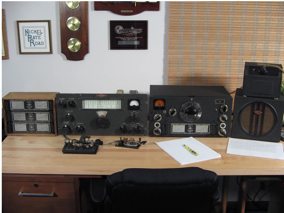
310B-1 & HRO-5TA1